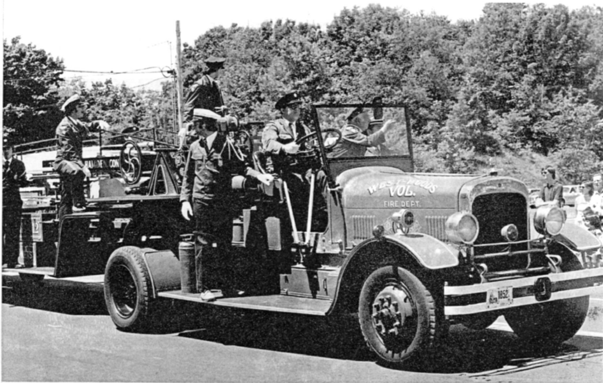
West Woods Volunteer Fire Association, Co 9. 1929 Seagrave Tiller Aerial Ladder Truck